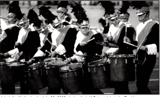
Jubal, the Netherlands, July 26, 2002, during their U.S. tour.

After Jan Meijer and Jaap van Waveren, the pioneers of Beatrix, spent a summer with different Drum Corps International corps, Beatrix made a trip to Birmingham, AL, in 1979 to perform at the DCI Championships. The impact this trip had was so strong that there was no doubt in changing the unit into a drum and bugle corps, even though their type of show already had all the ingredients.