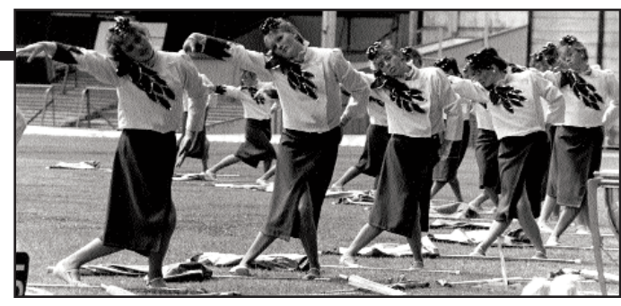
Avant Courir, the Netherlands, 1985 (photo by Mike Shayes from the collection of Drum Corps World).

About half of these eventually adopted the drum corps style. In the 1950s, the so-called "National Fife Days" were organized. At some of these well-run events more than 1,000 musicians gathered to perform. Also the field