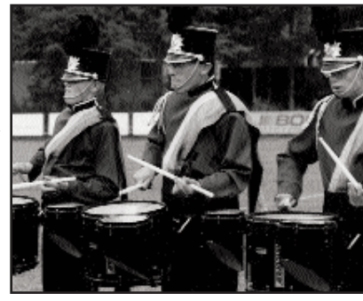
Blue Spirit, the Netherlands, 1998.

Percussion and main sponsor Dynasty will help the organization put drum and bugle corps back on the map in Europe where it belongs -- in CAPITALS.