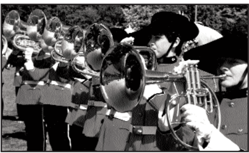
(Top to bottom) In Aethere Musica, the Netherlands, 1984; Joint Adventure, the Netherlands, 1998; Fidele Vogelsanger, Germany, 1986.