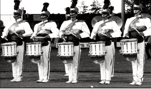
(Top to bottom) Con Fuoco, the Netherlands, 1993; Avalance, the Netherlands, 1985; Blue Wave, the Netherlands, 1989.

season was the change of the championships venue to the city of Nijmegen to better serve numerous German fans. The championships returned to the Goffert Stadium in Nijmegen for another few years in the early 1990s.