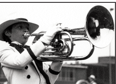
Borsolino, Belgium, 1989.

Following Jubal's example, many groups throughout the country were formed in the years that followed. Among these were Juliana from Amersfoort, formed in 1926; Excelsior from Rotterdam (1928); De Pijpers from Vlaardingen (1929); Excelsior from Goes (1930); Jong Jubal from Dordrecht (1932);