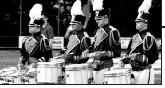
Schlossgarde, Germany, 1992 (photo by Edward Scholten from the collection of Drum Corps World).

Their name says enough. They're a band, but with true corps resemblance. It would be great if they joined international competition.