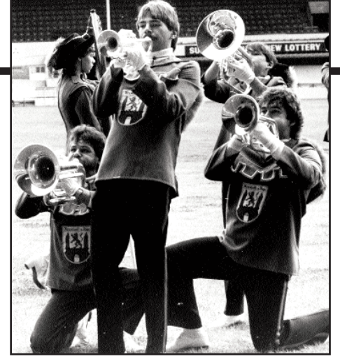
Wölper Löwen, Germany, 1985 (photo by R.W. Harris from the collection of Drum Corps World).

DIO competed in DCH for four years and then left. Today the corps is still active, but is no