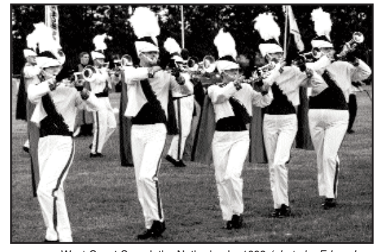
West Coast Sound, the Netherlands, 1998 (photo by Edward Scholten from the collection of Drum Corps World).

An immediate growth in competition was seen in 1982 when Jubal, Beatrix and Oranje